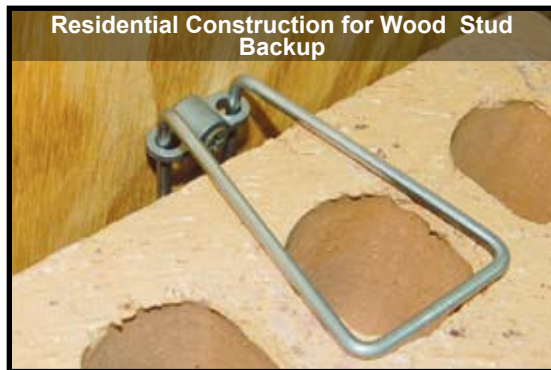
Greater Seismic Performance than Standard Corrugated Wall Ties and Complies with OSHA Safety Requirements

For Attaching Brick Veneer to Wood Frame or Concrete/CMU Backup Walls