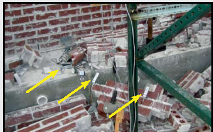
Brick veneer wall falls under moderate earthquake when attached with 22Ga wall ties and nails.

For more information regarding the results of recent shaking-table tests on three-dimensional structures, see the "Seismic Performance of Modern Masonry" report in The Construction Specifier Magazine , December 2009 issue.