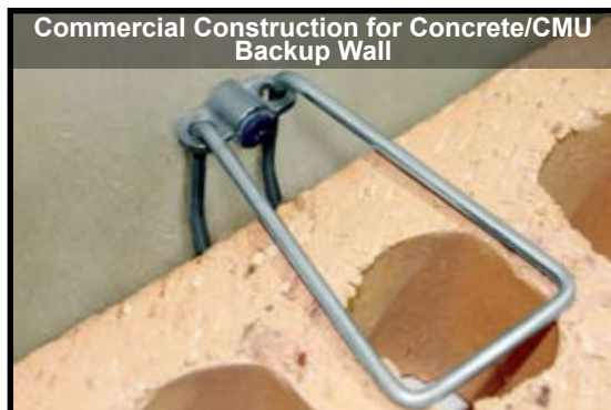
A More Efficient and Less Costly Alternative to Dovetail Anchoring Systems.